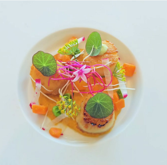
@chef.nitinbali “Seatopia” Romesco sauce, Lightly Seared Bay Scallops

Our Pillow Gnocchi is hand-rolled to perfection, it’s paired with savory Lamb Pancetta, tangy buttermilk, and bright pops of preserved lemon — a combination that’s rich, unexpected, and utterly unforgettable.