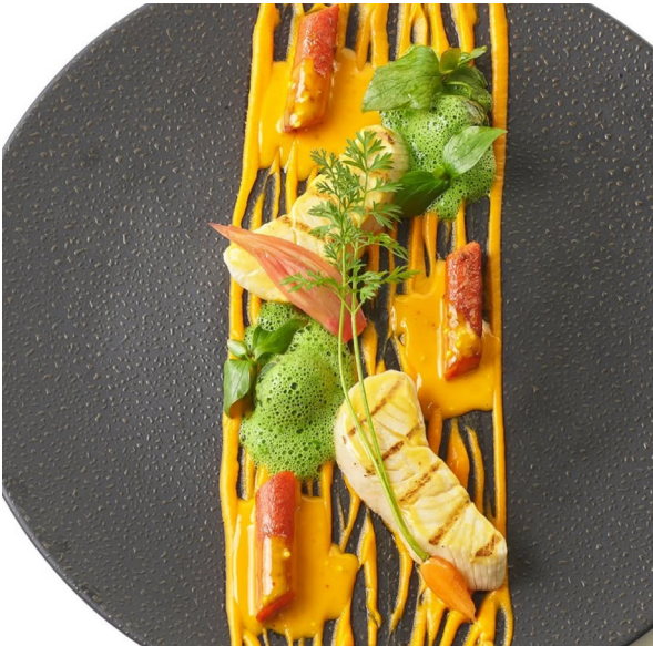
@lerouxeddy Kyushu Grilled Kampachi with Pink Peppercorn- Cumin Braised Carrots, Myoga, Nettles and “Sauce Angevine”