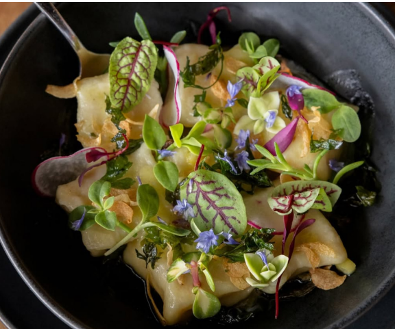
@baronson1st Soft as a cloud. Rich as a dream.

We want to feature you, our loyal customers. Take photos of your dishes made with our products and share them on Instagram. Tag your posts with @farmerleejones and @thechefsgarden_ohio #thechefsgarden or email us at marketing@chefs-garden.com to be featured in our collateral.